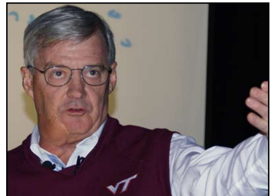
Right: Frank Beamer, Virginia Tech University.

Bridgeman and St. Joseph High Schools was honored as the Jim Crowley Award Winner, the highest honor the MHSFCA bestows on a coach.