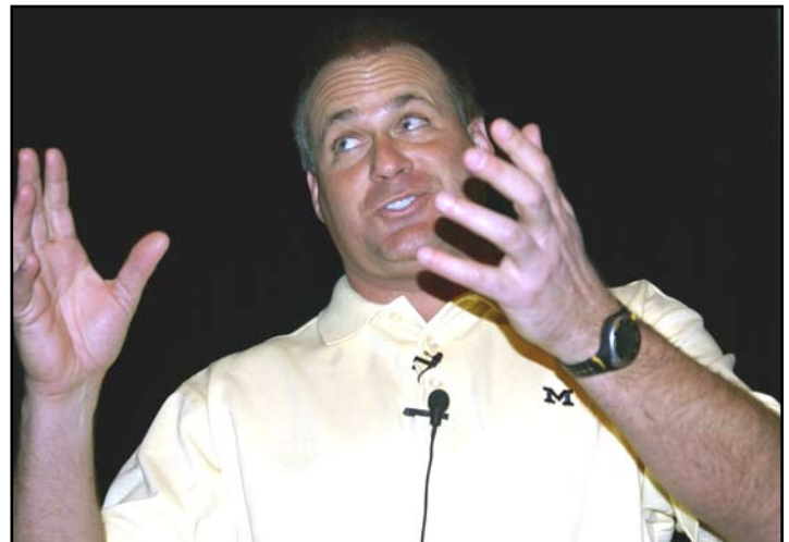
Above: Rich Rodriguez, Head Coach The University of Michigan.