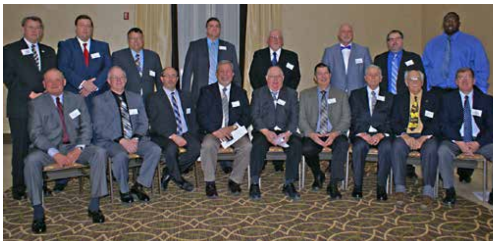
The Hall of Fame Class of 2015 Inducted in Ann Arbor, March 28, 2015

33 YEARS OF REMARKABLE COACHES THEIR CAREERS, ACHIEVEMENTS, AND PASSION FOR FOOTBALL