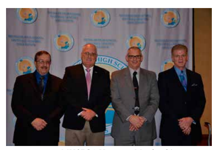
2015 MHSFCA Honorary Membership