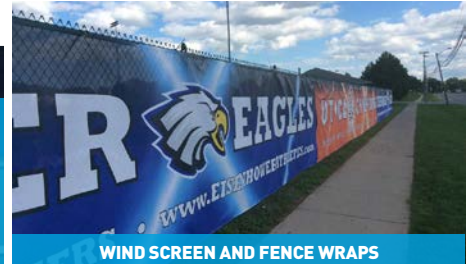
WIND SCREEN AND FENCE WRAPS