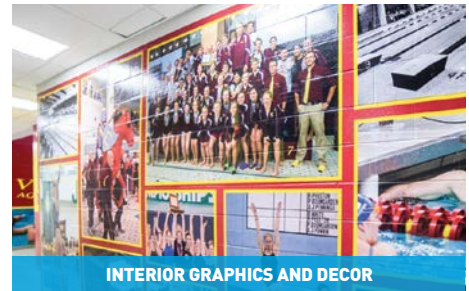
INTERIOR GRAPHICS AND DECOR