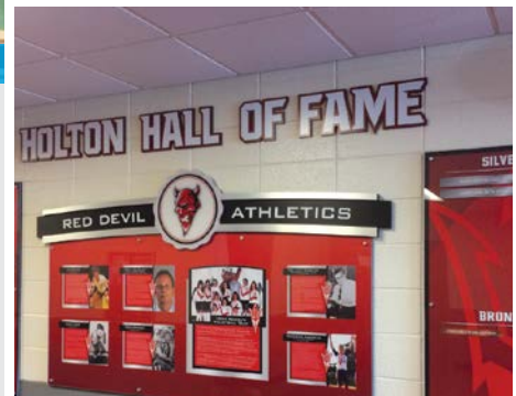
HALL OF FAME SIGNAGE, AWARDS, AND RECOGNITION