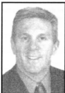
Ron Zook HEAD COACH UNIVERSITY OF FLORIDA