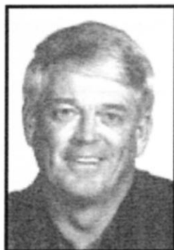
Dennis Erickson HEAD COACH UNIVERSITY OF OREGON