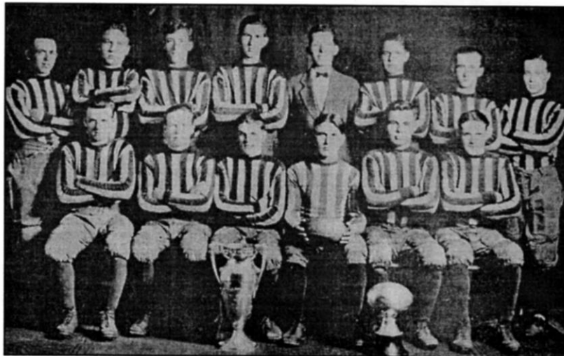
This is believed to be the 1925 Ionia High School Football team with the trophy now on display at Ionia County National Bank. Anyone with information about the picture is encouraged to contact the Ionia Sentinel-Standard.