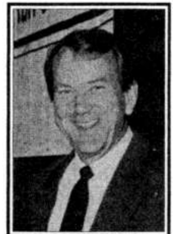
Lloyd Carr UNIVERSITY OF MICHIGAN

Larry Smith has 121 wins as a head football coach at Tulane University, The University of Arizona, Southern California and currently at the University of Missouri. He started his college coaching with "Bo" Schembechler at Miami of Ohio and went with "Bo" to the University of Michigan as offensive line coach. He is the only active head coach in college football who has taken four different teams to a bowl game. While at Southern California he won three Pacific 10 Conference championships and his teams posted a school record 19 consecutive wins. He is a real gentleman and Larry is considered one of the best head coaches in the country.