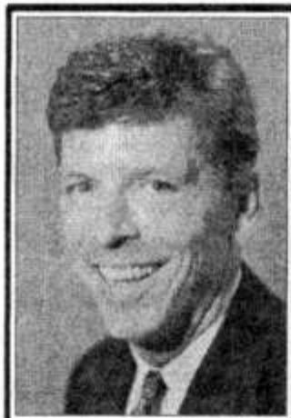
Cam Cameron INDIANA UNIVERSITY

Coach Beamer's teams have been in five consecutive bowl games. During that period of time his teams have posted a record of 44-16 against some of the best teams in the nation. In 1995 and 1996 his teams posted 10-2 records while winning the Big East Conference Championship. He is a graduate of Virginia Tech and was inducted into their hall of fame in 1997. During his tenure as the head football coach at Murray State, his teams posted a 42-23-2 record.