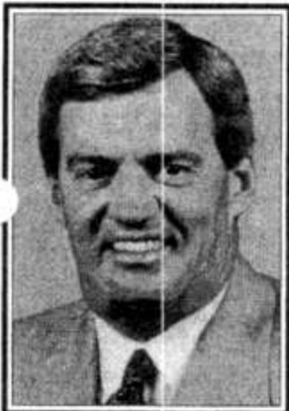
Frank Beamer VIRGINIA TECH

at the MT. PLEASANT SOARING EAGLE CASINO HOTEL Check MHSFCA Clinic Flyer for Coach of the Year Registration Will Feature