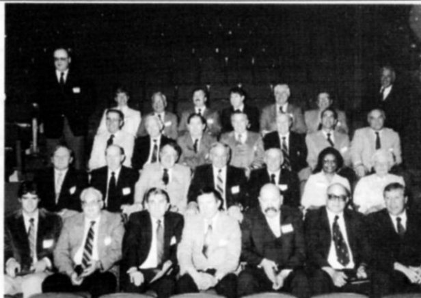
An outstanding group of inductees who have spent a great part of their lives involved with high school football players.