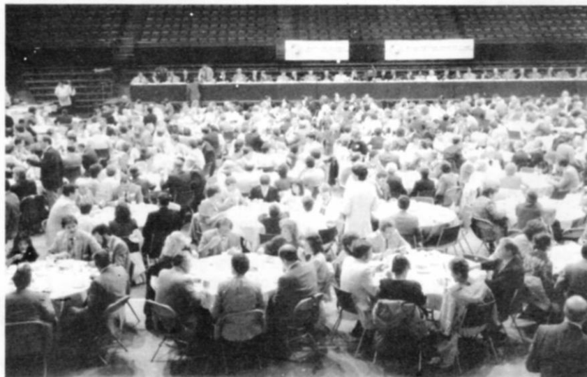
The floor at Crisler Arena is filled to capacity for this years M.H.S.F.C.A. Hall of Fame Banquet. The banquet was very successful with many outstanding football coaches being inducted.

Below is a list of the inductees and the schools they have served.