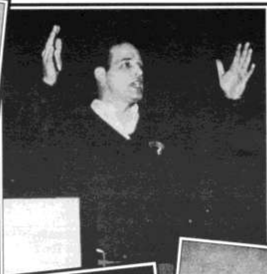
Top Center: University of Toledo head coach, Gary Pinkel wrapped-up Friday night's session with a talk about "Rocket Football."