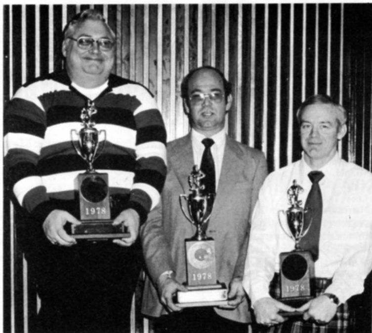
MICHIGAN FOOTBALL COACHES OF THE YEAR