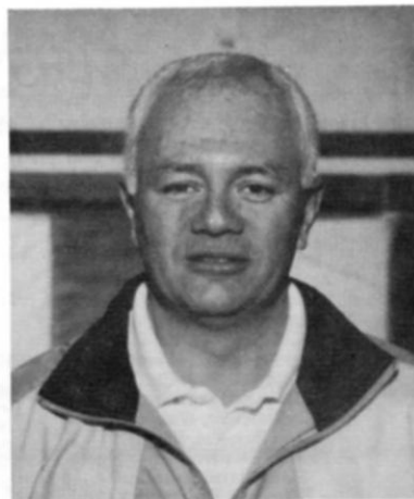
Thank You and God Bless You All,

I am lucky because it looks like I will not have to have anymore surgery. I hope with a good attitude and a lot of therapy my knee will stabilize and I will be able to do some of the physical things I have always enjoyed doing.