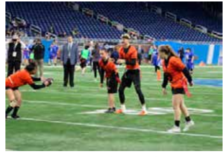
Brighton HS vs Holt HS Saturday November 24, 2018