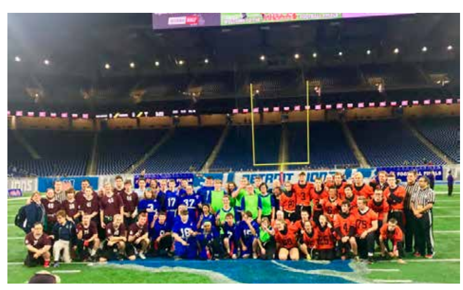
2018 Unified Championships: Brighton, Holt, Mason, and Sparta High Schools.