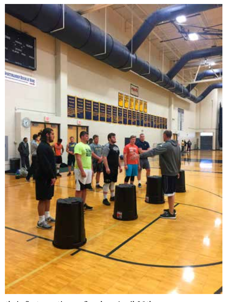
Players and coaches from the West Team have their first practice on Sunday, April 30th.