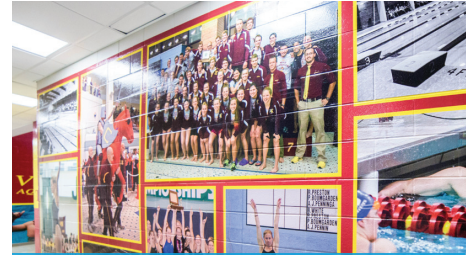
INTERIOR GRAPHICS AND DECOR