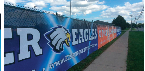
WIND SCREEN AND FENCE WRAPS