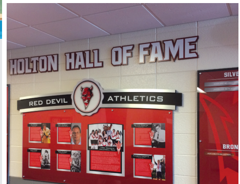
HALL OF FAME SIGNAGE, AWARDS, AND RECOGNITION